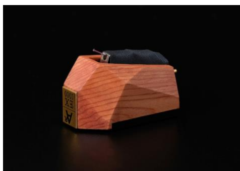
Left The body of Analog Relax's EX1000 cartridge is carved from 2000-year-old Yakusugi cedar

The concept of being at one with yourself and the world around you is embedded deep within Japanese culture and is also central to Yurugi's philosophy. He makes phono cartridges with bodies carved from exotic woods selected for their acoustic properties, fashioning perfectly realised marvels of microengineering with exceptional skill. The pleasure generated by these beautifully crafted physical objects, each fulfilling a singular purpose – to deliver glorious, living, breathing sound from a vinyl record – is a perfect example of the joy of 'analogue living'.