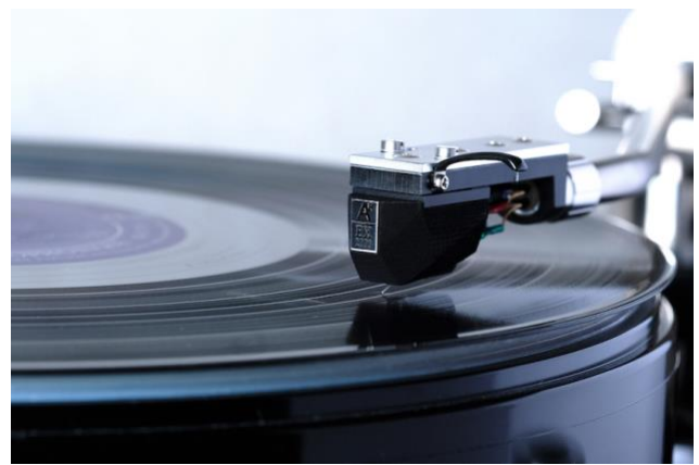
Above Thiele TT01 turntable (left) and Analog Relax EX2000 cartridge (right)